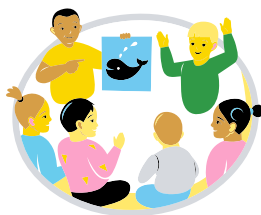
Participation and advocacy