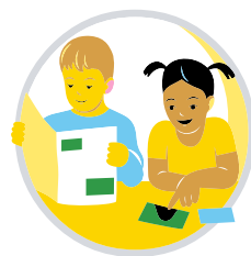
Multi-literacy and ICT