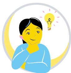
Thinking and learning