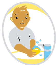
Self-care and everyday skills