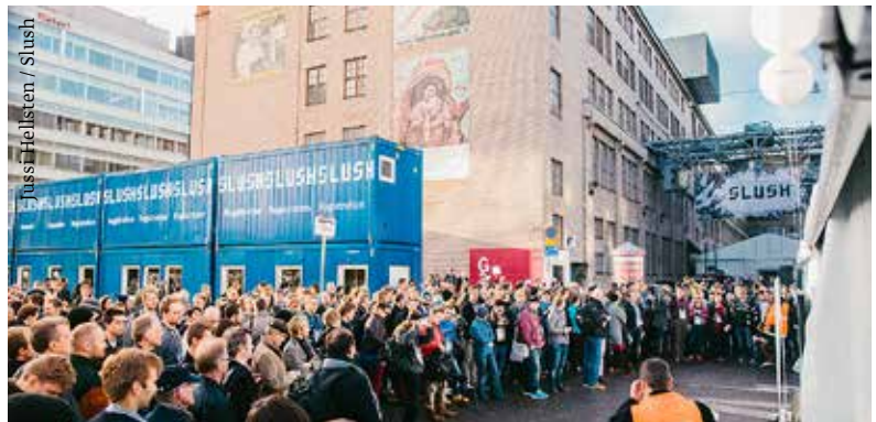
Slush 2013 at Cable Factory, Helsinki

Slush is Northern Europe's largest start-up conference that puts together start-ups and tech talent with top-tier international investors in Helsinki. slush.org