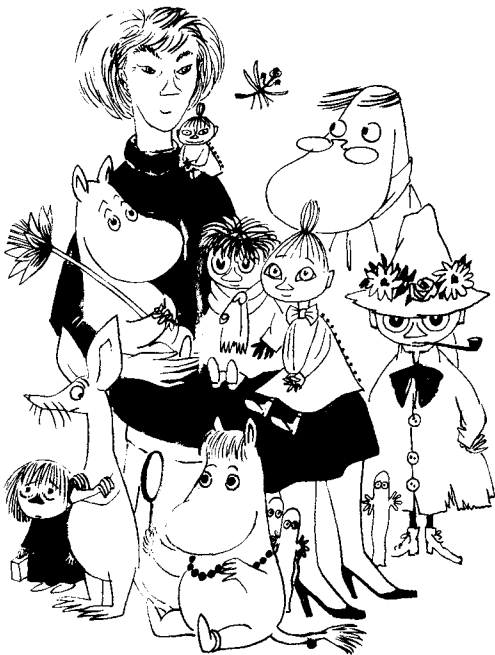
Tove Jansson's self-portrait with Moomin characters