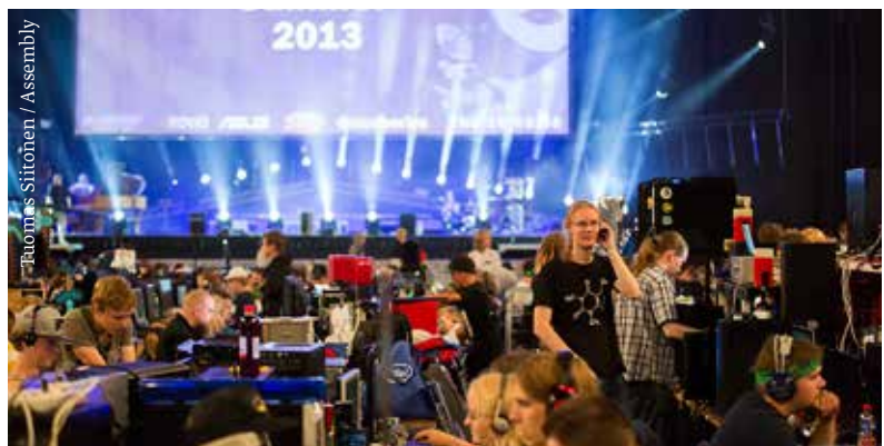
Assembly 2013 at Hartwall Arena, Helsinki