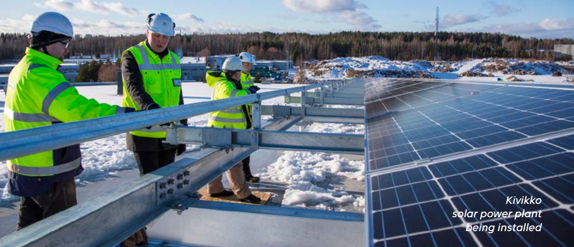
Kivikko solar power plant being installed