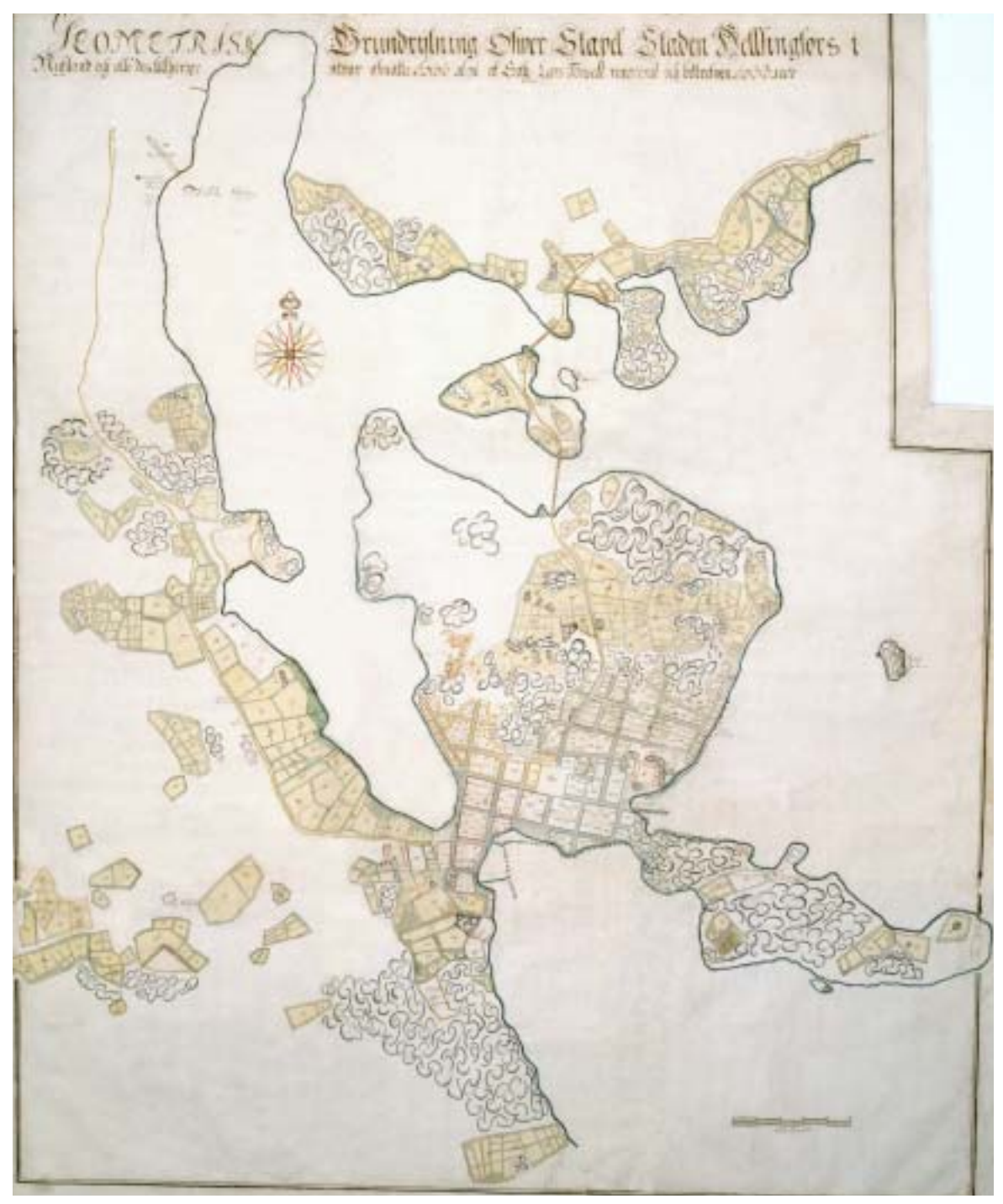
This map showing Helsinki in its new location on the Vironniemi (Estnäs) isthmus was drawn after a survey made in 1696. It is an important source of information on 17th century Helsinki, which was destroyed in 1713, during the Great Northern War (1700–1721).

Original map 155 x 134 cm, Swedish National Archives.