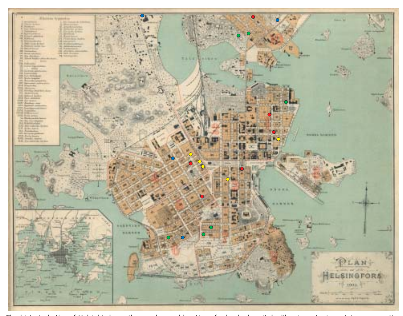
The historical atlas of Helsinki shows the number and location of schools, hospitals, libraries, etc. in certain cross-section years. This map shows kindergartens in Helsinki in 1900: those for Finnish- and Swedish-speaking children as well as three German, two French and one Russian-language kindergarten.

tury, the time when Helsinki was moved to its present location.