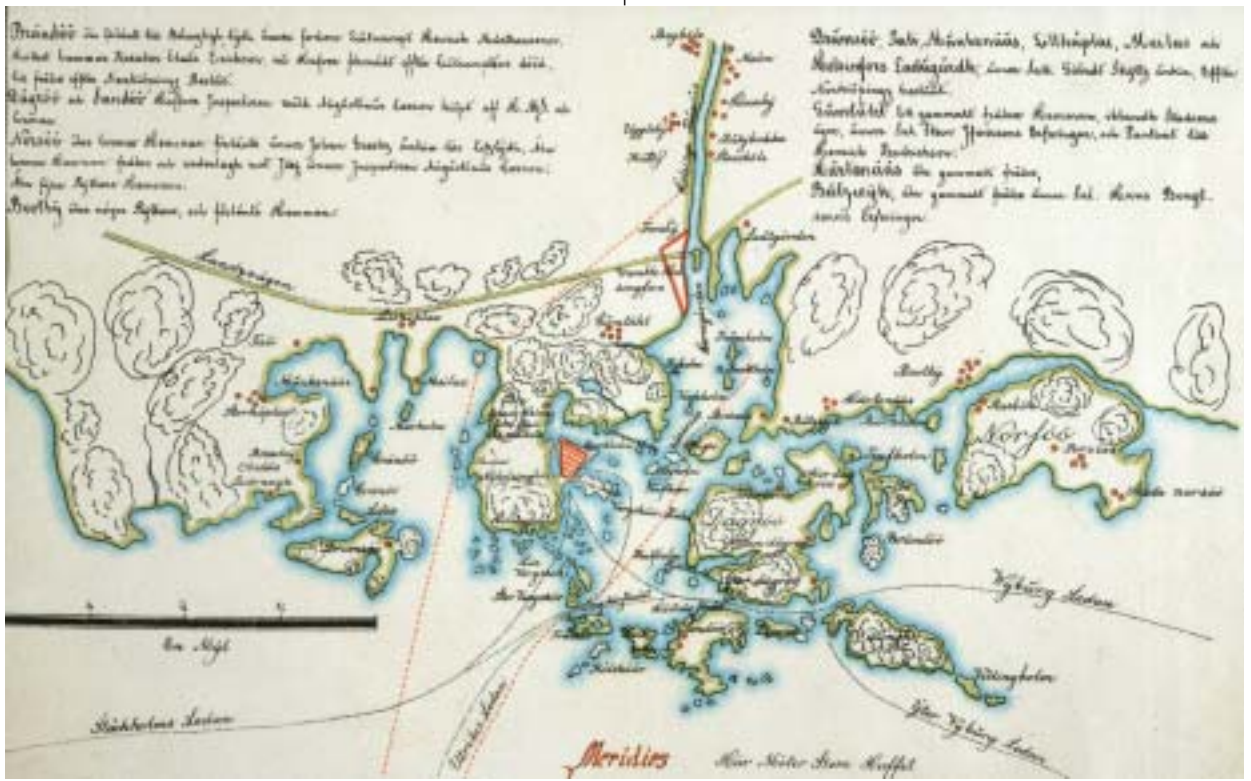
A map from the mid-17th century shows where Helsinki was founded in 1550 and also the block structure of the town in its new location on the Vironniemi (Estnäs) isthmus. This plan was never applied. The map also shows the highway between Turku (Åbo) and Vyborg (Viipuri/Viborg) as well as sailing fairways and many local names. Original map 30 x 40 cm, Swedish National Archives.

The centrepiece of the historic town atlas is the town plan seen as a historical document. According to professors Anngret Simms from Dublin and Ferdinand Opll from Vienna, who have compiled a list of atlases of historical towns published in Europe and who share the chairmanship of the Editorial Group for Historic Town Atlases in the Commission for the History of Towns. The atlases are not only compiled for the academic sector to serve as source material for urban history: they can provide guidelines for planners, they can strengthen the local identity of city residents by showing them to the roots of their neighbourhood, and, very importantly too, the atlases are a gold mine for local historians.