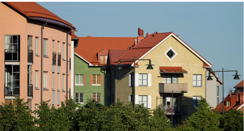
Vantaa Innovation Institute Ltd. Äyritie 18, FI-01510 Vantaa, Finland www.vantaainnovation.fi