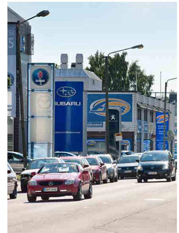
Herttoniemi business area

The Neighbourhood Project promotes suburban local entrepreneurship in the business areas of Meri-Rastila, Myllypuro and Herttoniemi. The experiences of immigrant entrepreneurs are surveyed in Meri-Rastila. Interaction and contacts with the residents and entrepreneurs are an important part of the vitality of the neighbourhoods.