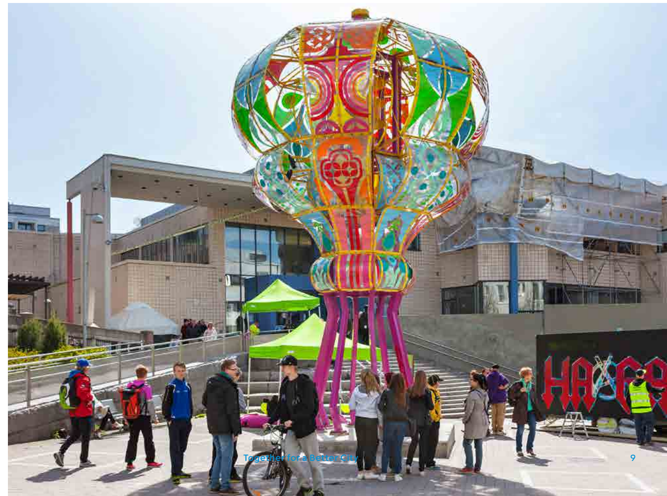
The Unelma (Dream) artwork is at the Sitatori square in Kannelmäki.

In the current period and celebrating its 20th anniversary in 2016, the Neighbourhood Project focuses especially on Jakomäki, Kannelmäki, Malmi, Malminkartano, Meri-Rastila and Pohjois-Haaga. In addition to the area-specific activities, the flexibility in the development of the entire suburban area is preserved.