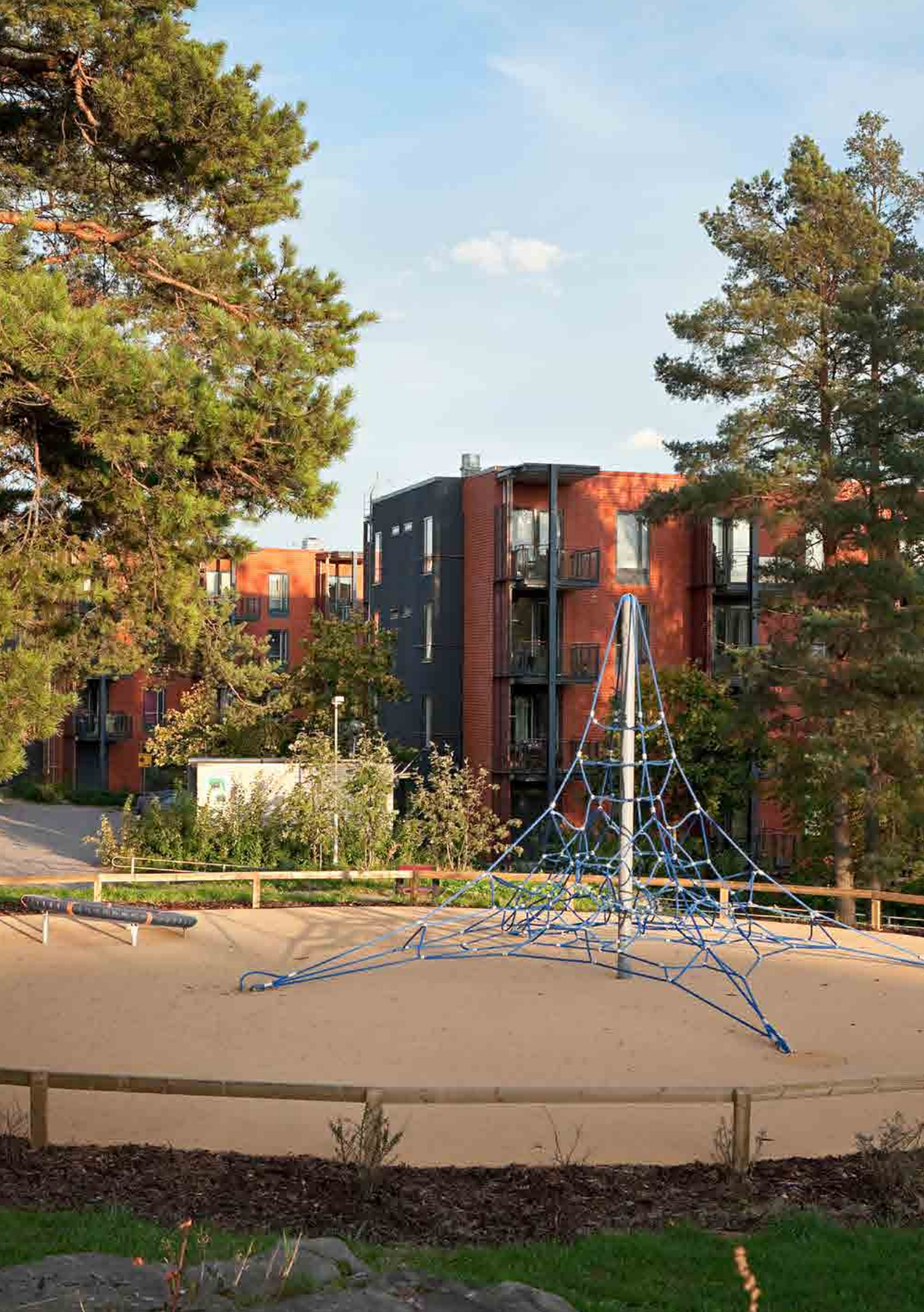
Roihuvuori resident park