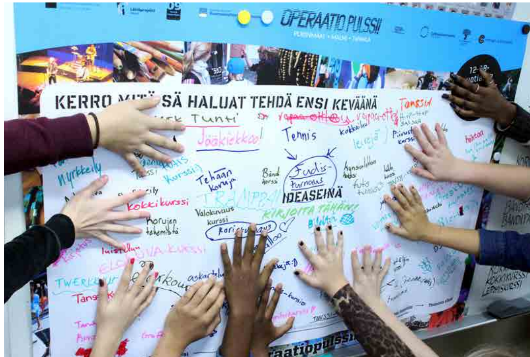
In Operation Pulse, young people plan their own hobby activities.