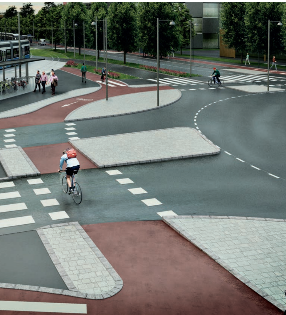
Raide-Jokeri at Käskynhaltijantie street in Oulunkylä.