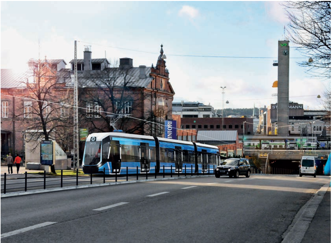
Visualisation of the Tampere light rail on Itsenäisyydenkatu.

In Turku, the first phase of general planning of the light rail system is ongoing. After a comparison of the possible lines, the City Board decided that in the first phase, the rail lines would run on a three-branch track network from Kauppatori to Runosmäki, Skanssi and Varissuo. The total length of the routes would be approximately 19 kilometres, there would be 33 stops and the estimated daily number of passengers in 2035 would be approximately 22,000.