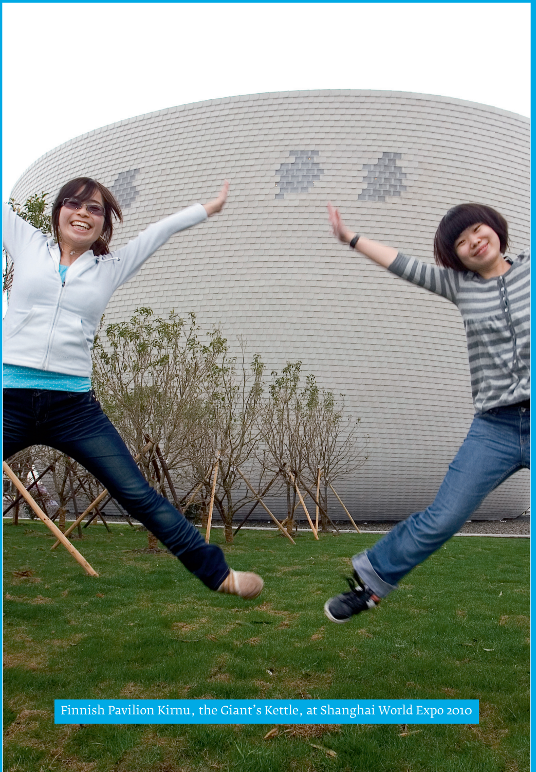
Finnish Pavilion Kirnu, the Giant's Kettle, at Shanghai World Expo 2010