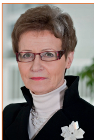
Ms. Marketta Kokkonen Mayor of Espoo