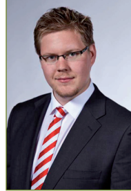
Mr. Antti Lindtman II Vice Chairman of the Helsinki Metropolitan Area Advisory Board Chairman of the City Council