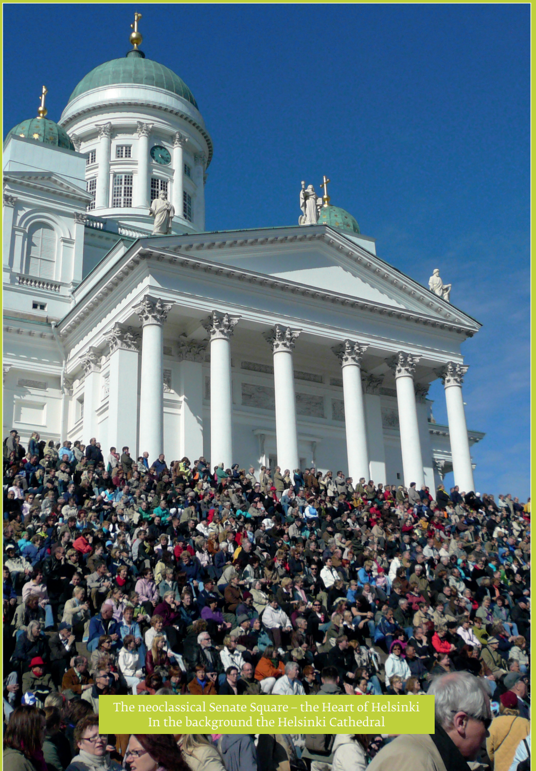
The neoclassical Senate Square – the Heart of Helsinki In the background the Helsinki Cathedral